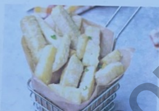
113.FRIED YAM 45 炸木薯