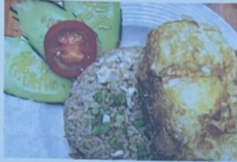
96.SALMON FRIED RICE 98 三文鱼炒饭