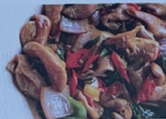
100.SPICY PIG INTESTINE 110 爆炒大肠