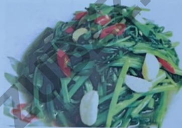
94.STIR CHINESE LEAVES 炒空心菜 68