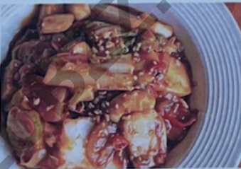
99.Spicy Fried Squid Rice Cake 139 辣炒鱿鱼年糕