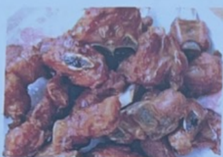
112.FRIED RIBS 75 炸排骨