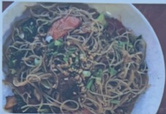
97.FRIED RICENOODLES seafood 105 炒米粉 - choose of chicken 70, beef 80