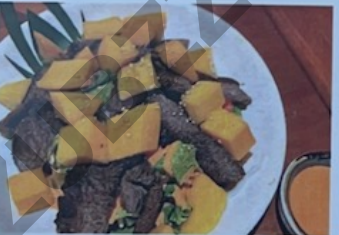
80.MANGO BEEF SALAD 98 芒果牛肉沙拉