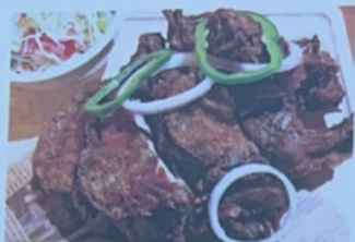
111.FRIED CHICKEN BACK 68 炸鸡架