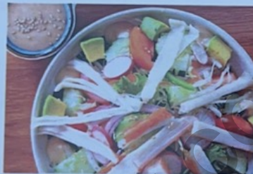
93.CRABSTICK SALAD 蟹肉沙拉 85 -CRABSTICK AVOCADO,LETTUCE