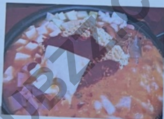
114.KOREAN HOTPOT SEADOOD 320 韩式部队锅