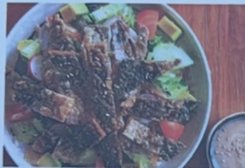
92.CRISP SALMONSKIN SALAD 98 鱼皮沙拉 -FRIED SALMON SKIN AVOCADO,LETTUCE