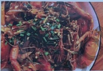
98.FRIED LIVERSHRIMP 炒河虾 85