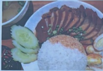
77.HONEY BBQ PORK RICE 105 蜜汁猪肉叉烧饭