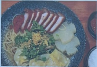
78.PORK CHAR SIEW NOODLE SOUP 105 猪肉叉烧汤面