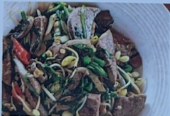
80A.STIR FRIED PORK LIVER 90 爆炒猪肝