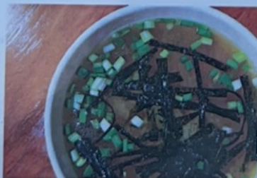
95.MISO SOUP 味增汤 35