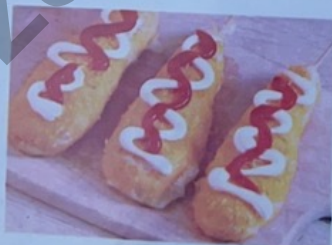
115.FRIED CHEESE SAUSAGE 80 芝士肠