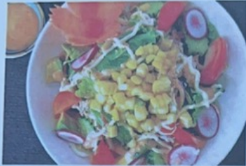
91.VEGETABLES SALAD 蔬菜沙拉 70 -lettuce, corn, onion radish