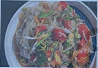
79.YUM WOON SEN POTATO NOODLES 85 泰式酸辣拌粉