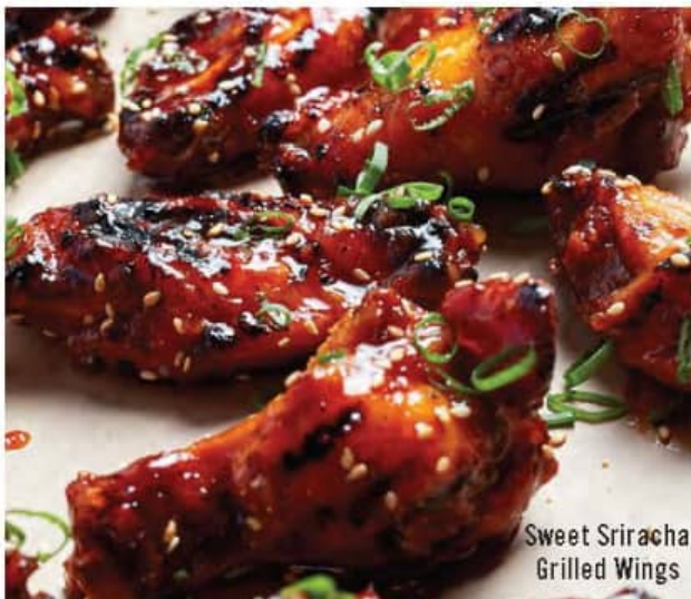
Sweet Sriracha Grilled Wings