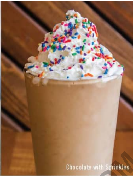
Chocolate with Sprinkles