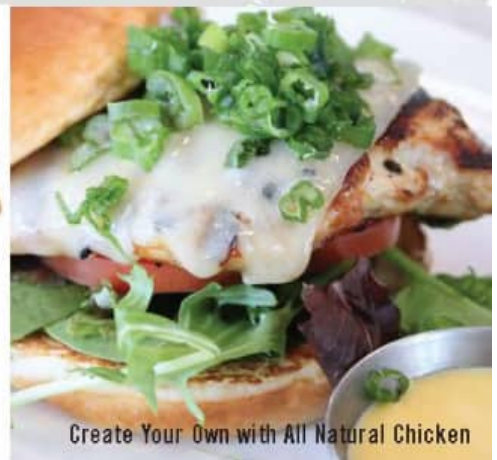
Create Your Own with All Natural Chicken