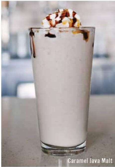
Caramel Java Malt