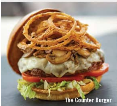
The Counter Burger

all natural beef • organic mixed greens roasted tomatoes • parmesan fries • hickory BBQ • american cheese • brioche bun 62