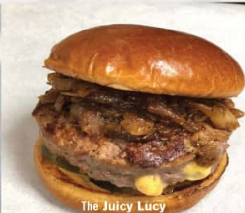
The Juicy Lucy