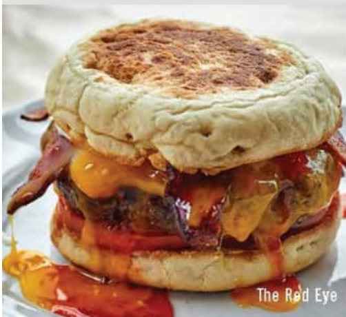
The Red Eye

*Consuming undercooked meats, seafood, or eggs may increase your risk of foodborne illness. All ingredients in-store may contain traces of nuts, nut oils, or may have been made alongside other products containing nuts.