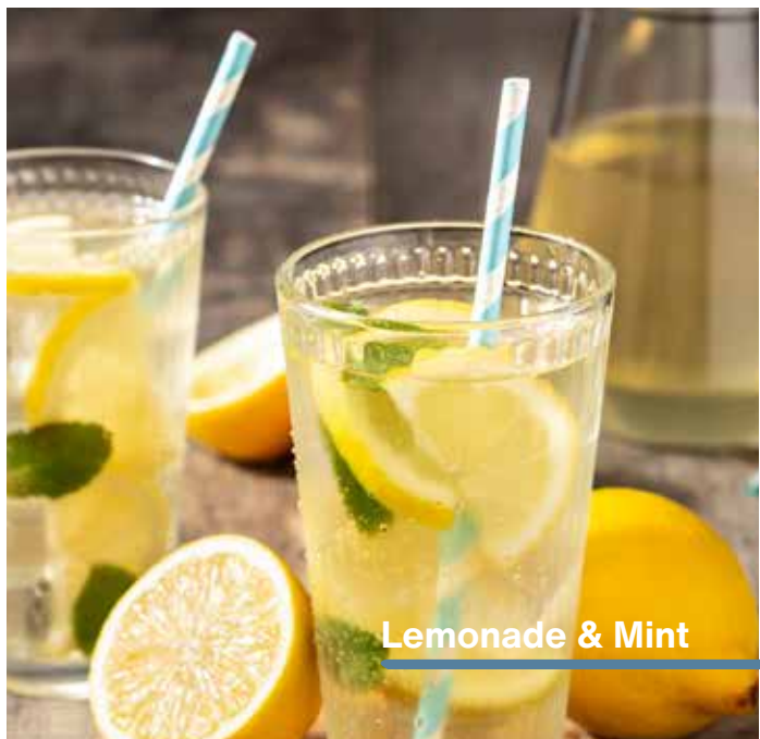
Lemonade & Mint